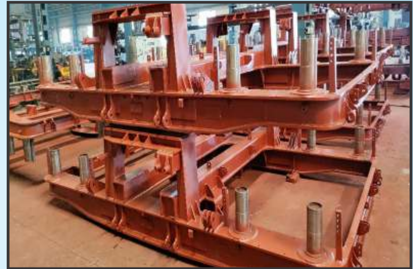
Bogie Frames for Conventional Coaches