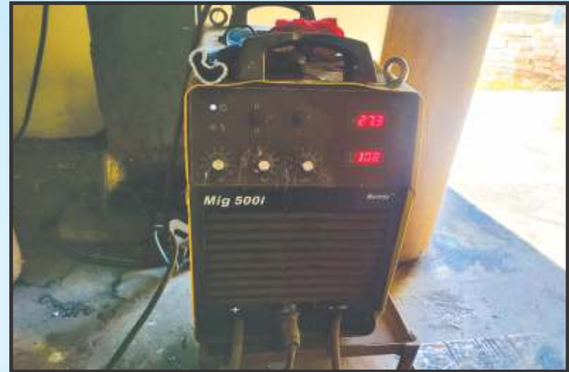
MAKE:- ESAB/GAIGU/MOGRA/SUNRISE/PANASONIC CAPACITY/RANGE:- 400 Amps/500 Amps MODEL:- MIG400 CCCV, SNER-500M MACHINE No:- 19074400490 YEAR OF BUILD:- 2009-2019