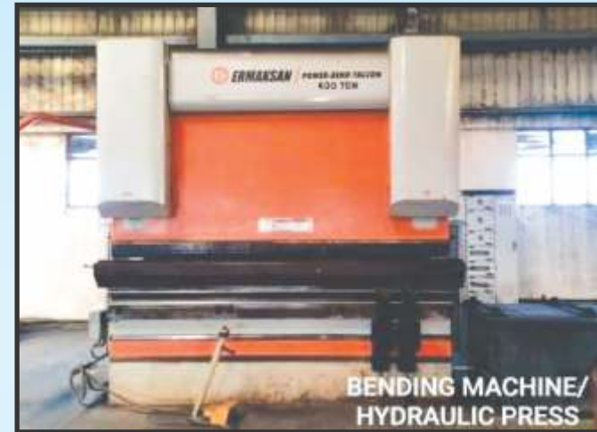
Cnc Hydraulic Press Brake Power-Bend Falcon

MAKE:- EMARKSON CAPACITY/RANGE:-3m / 400 Ton MODEL:- (20748-K4J3V4)