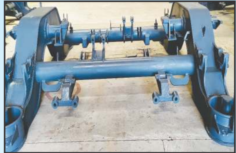
Bogie Frame For LHB Coaches