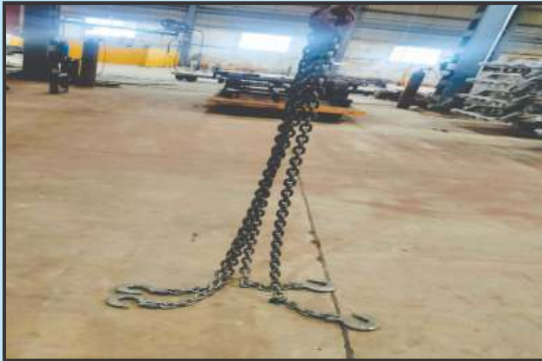
Lifting Tackle/Chain Slings