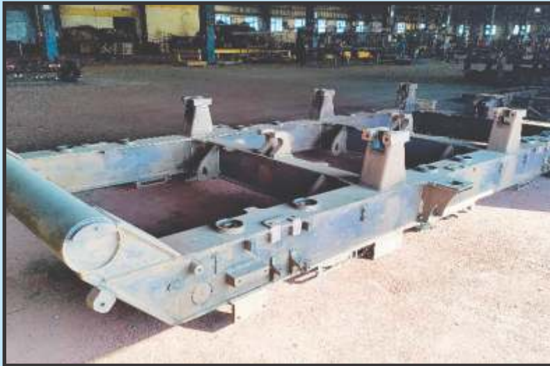
Bogie Frame Complete for Co- Co Locomotive