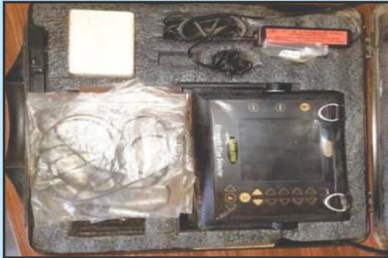
Ultrasonic Test Set Up

RANGE/ACCURACY: - 10 mm to 5 meter (0.500 in to 200 in) (in steel). In Hot Key mode it has 13 preset values