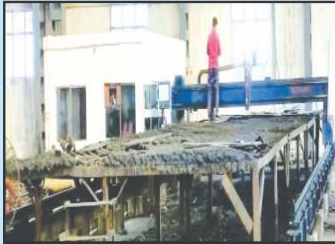
CNC Plasma Cutting Machine

MODEL : 1 - OMIMATT T, 2 - LCUT MACHINE No : 1 - 101119, 2 - 11312