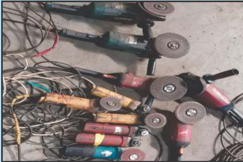
Grinders (AG 4, AG5, AG7, AG8)