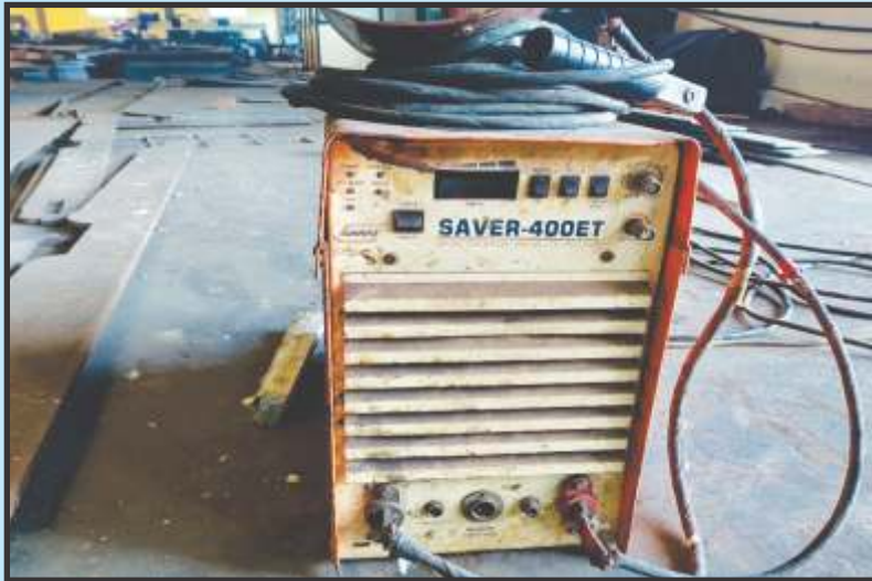
MIG Welding Machine(400 Amps)-25nos MIG Welding Machine(500 Amps)-10nos