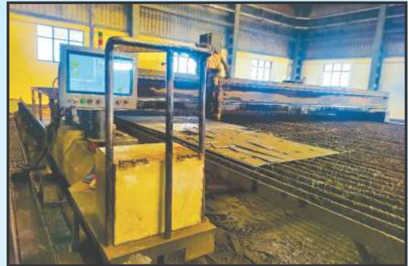
Plasma Cutting Machine