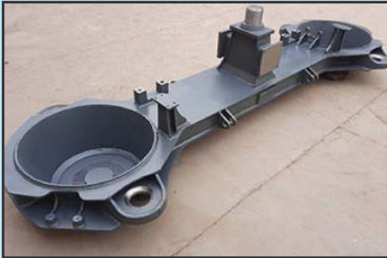
LHB Bogie Bolster