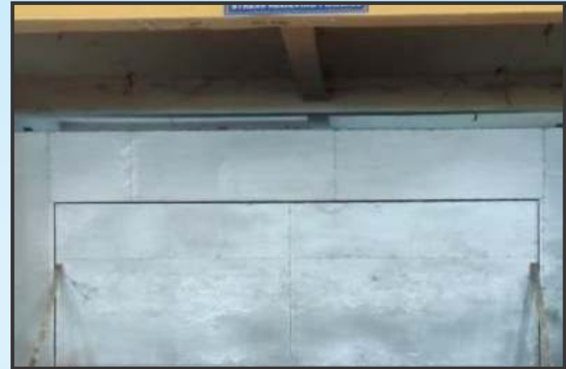
Heat Treatment Furnace with DataLogger

MAKE:-CRG Industries CAPACITY/RANGE:-7.6 m x 4 m MODEL:- SELF-MADE YEAR OF BUILD:- 2018