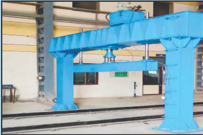
Bogie Static Load Testing Machine With Rails