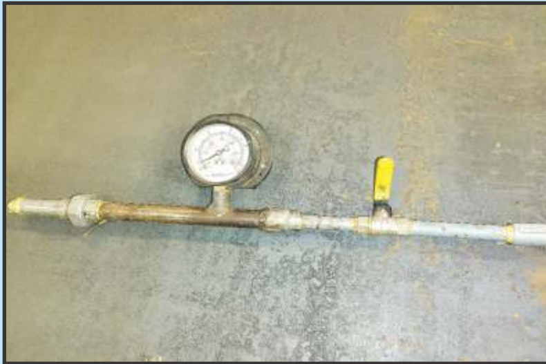
Bolster Dome Air Leakage TestingArrangement

Test Rig For Leakage Testing Pneumatic Piping.