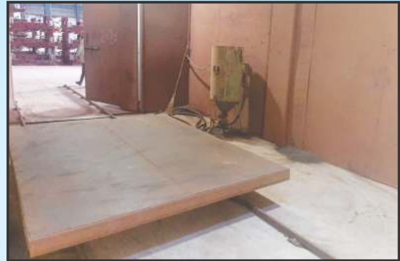
Shot Blasting Or Surface Preparation Plant

MAKE:- CRG Industries CAPACITY/RANGE:- Shots: Metal