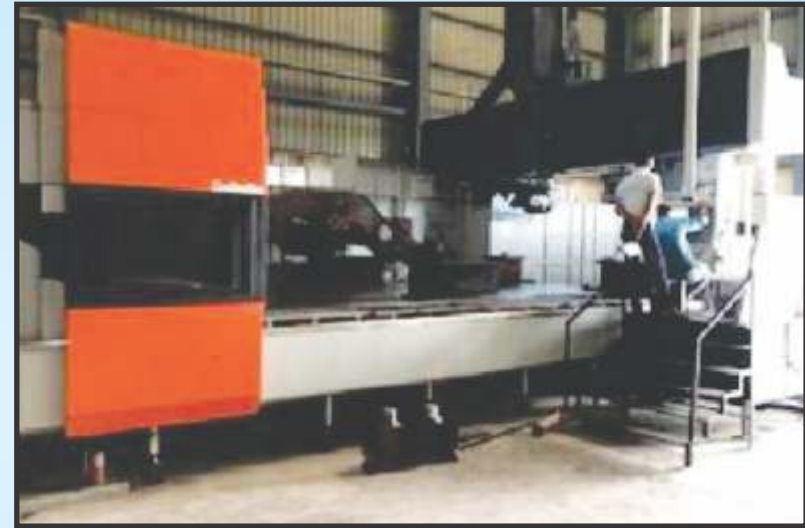
CNC 5-Axis Machining Center With Probing Facility.

MAKE:-POLYHYDRON CAPACITY/RANGE:- 500 tonMODEL:- POLYHYDRON MACHINE No:- PCM20/06-05- 315-23 YEAR OF BUILD:- 2014