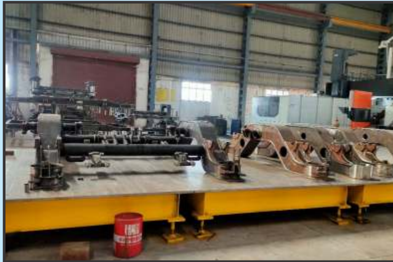
Level Surface Table

MAKE:-CRG Industries CAPACITY/RANGE:-7.6 m x 4 m MODEL:- SELF-MADE YEAR OF BUILD:- 2018