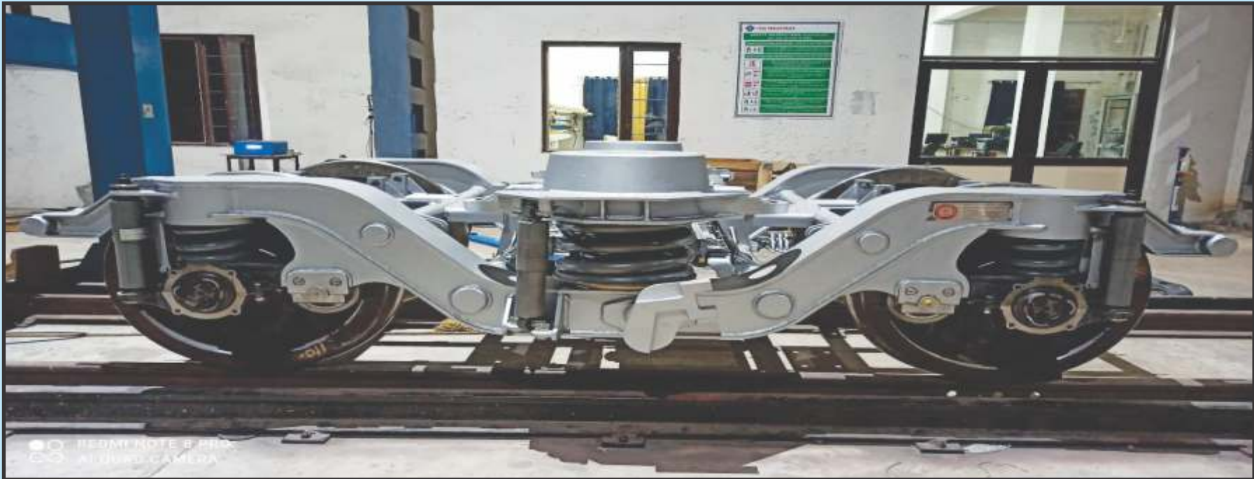
Fully assembled bogie frame for Mozambique railways