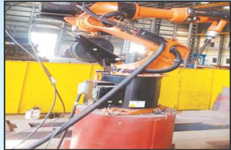
Robotic Welding With Synchronized Manipulator (Programable)