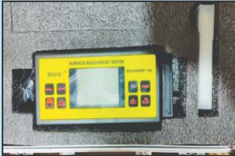
Digital Surface Roughness Tester