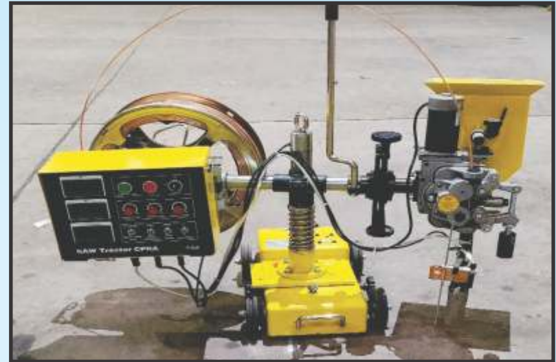
Saw Welding Machine