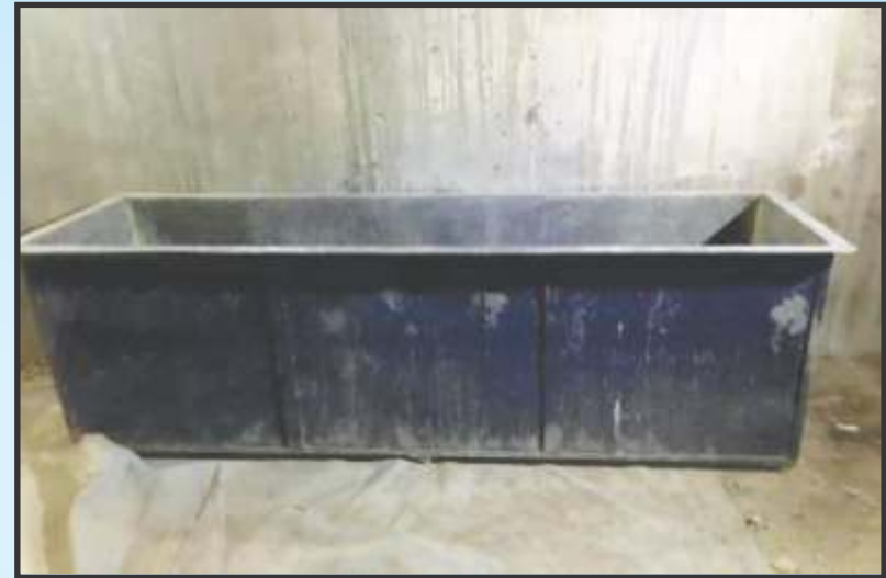
Degreasing/ De-Rusting Plant

MAKE:- AMBASSADOR CAPACITY/RANGE:- 1DEG CEL MODEL:- AMBASSADOR MACHINE No:- HAO-001 YEAR OF BUILD:- 2015