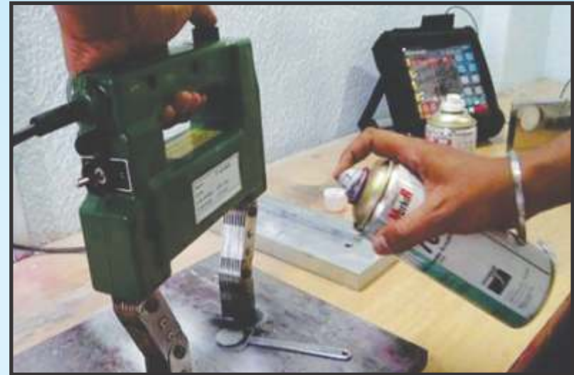
Magnetic Particle Test (Mpt)