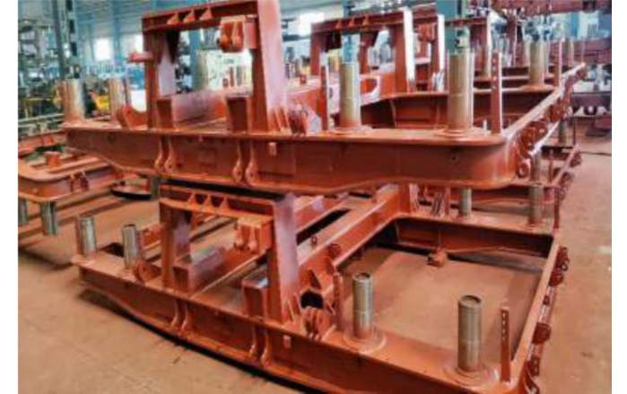
Bogie Frames for Conventional Coaches