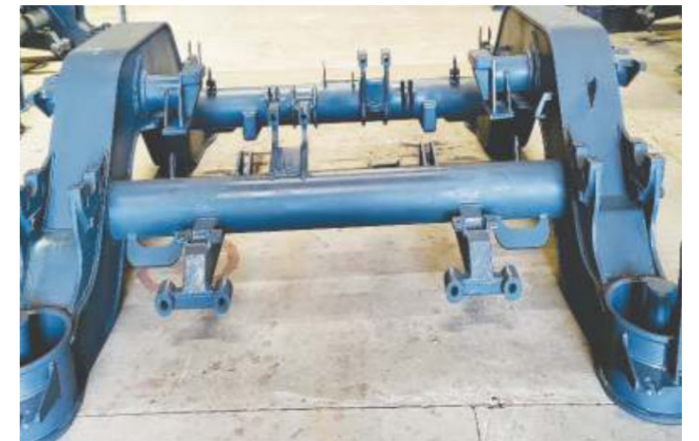
Bogie Frame for LHB Coaches