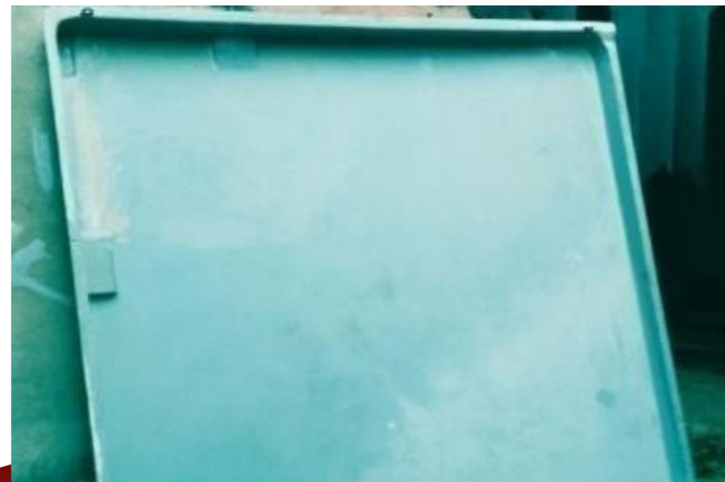
FRP Trough Below AC Unit