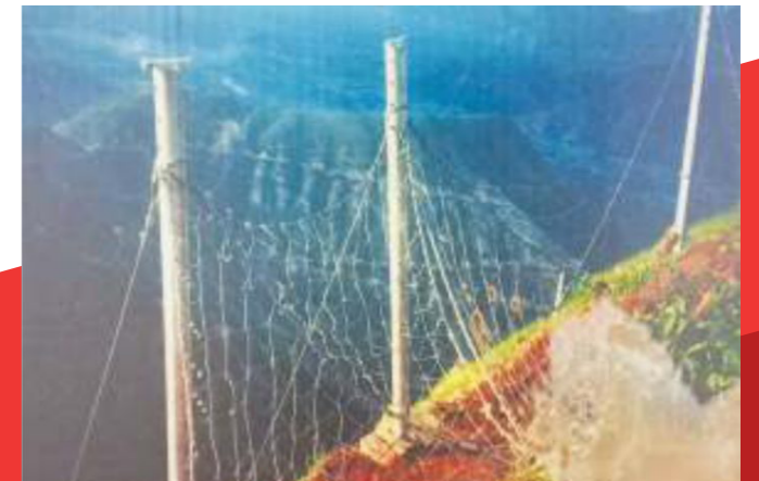
SNOW NETS ASSEMBLY - SNOW AVALANCHE CONTROL STRUCTURE