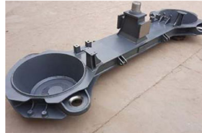
Bogie Bolster for LHB Bogie