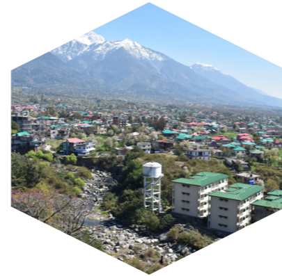
BADDI HIMACHAL PRADESH

The Barwala plant is a cornerstone of CRG Group's manufacturing prowess. Equipped with state-of-the-art technology and machinery, this facility is where precision engineering meets large-scale production. Specializing in heavy steel fabrication, the Barwala plant is instrumental in producing a wide range of components for the railway industry, including bogie frames and fully assembled bogies. The plant's location in Haryana places it within easy reach of major transportation networks, allowing for efficient distribution and logistics.