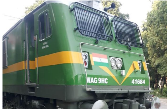
Complete Shell Assembly