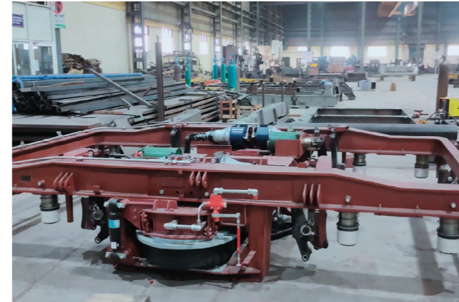
Semi Assembled Bogie for DETC Coaches