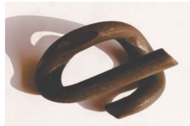
ELASTIC RAIL CLIP