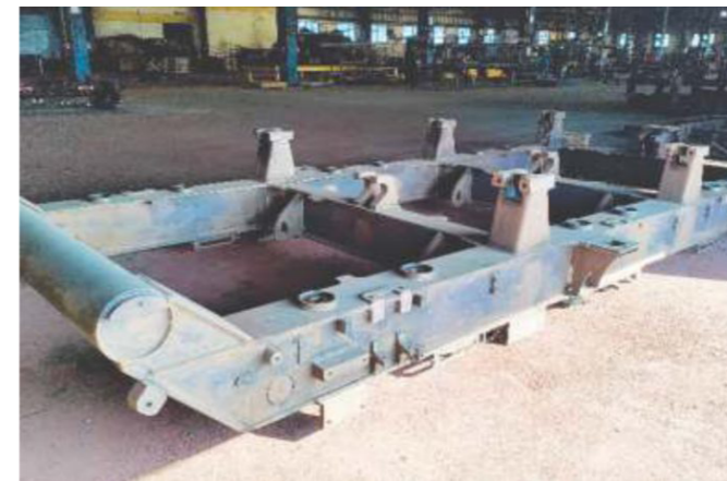
Bogie Frames Complete for Coco Locomotive