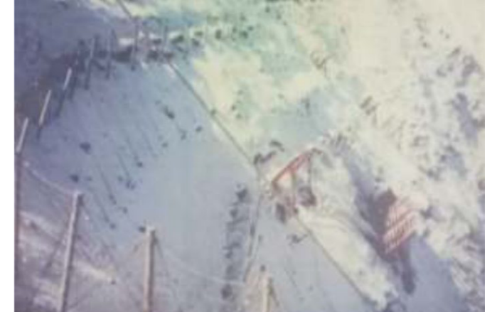
SNOW NETS ASSEMBLY - SNOW AVALANCHE CONTROL STRUCTURE