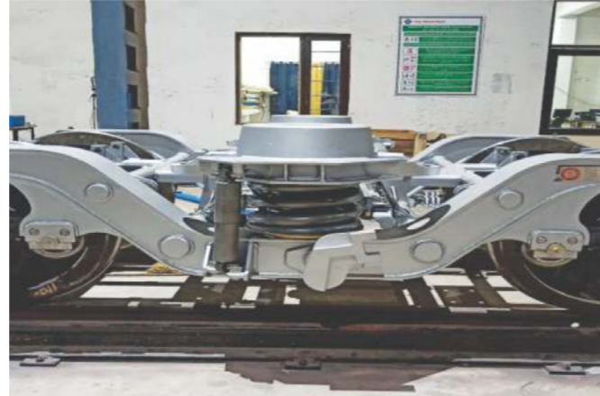
Fully Assembled Bogie Supplied for Mozambique Railway