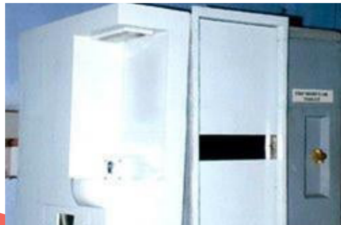
FRP Modular Toilets